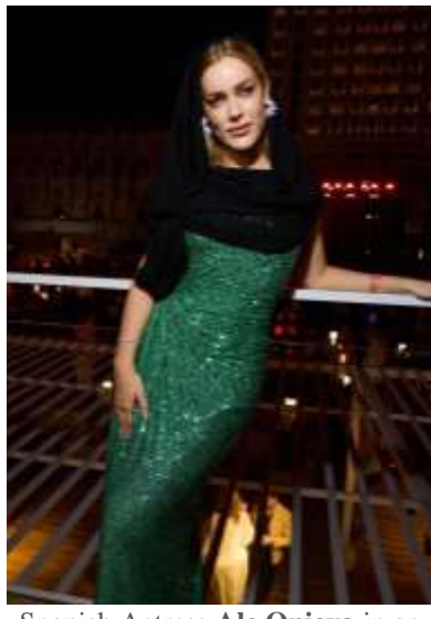
Spanish Actress Ale Onieva in an Emerald green one shoulder sequin dress from the Spring/Summer 23 Ready-To-Wear Collection