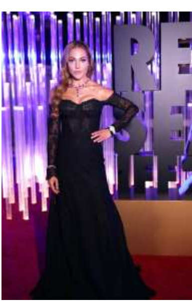
Turkish Actress Meryem Uzerli in a lace dress from the Spring/Summer 23 Ready-To-Wear Collection