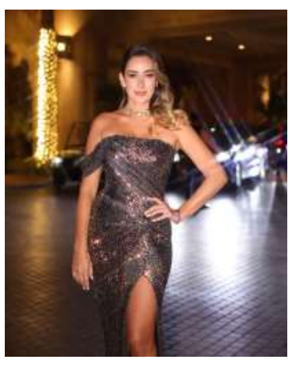
Egyptian Actress Amina Khalil wears a Rami Kadi Couture off-shoulder holographic gown adorned with scroll sequins embroidery.