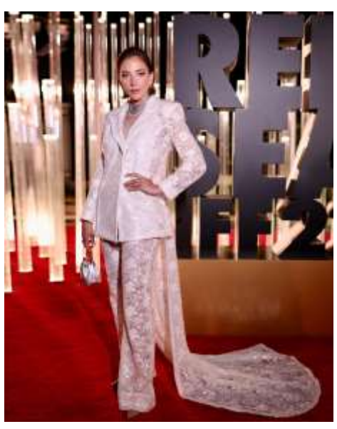
Saudi Arabian actress and filmmaker Fatima Al Banawi in a Rami Kadi blanc de blanc tailored suit